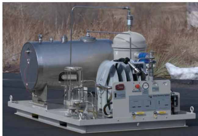
SRS 03 for Hydrant Equipment