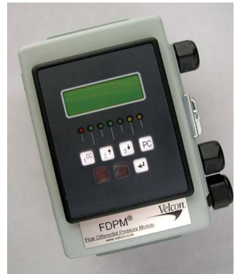
FDPM® (Flow Differential Pressure Module)

Please see see Data Sheet 1966 and/or our web site for more information: http://www.velcon.com/aviation/fdpm.html