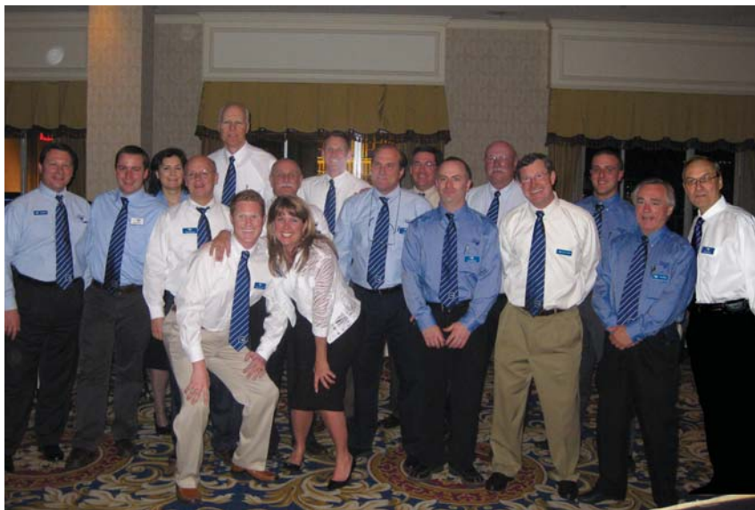
The Velcon Team at the 2009 AIE Show

For more information please see aviationindustryexpo.com