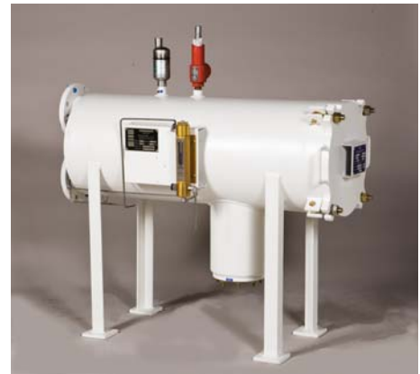
HV1633150: Stationary Horizontal Filter/Separator

For more information and quote and availability, please contact your local distributor or Velcon Filters at vfsales@velcon.com /719.531.5855