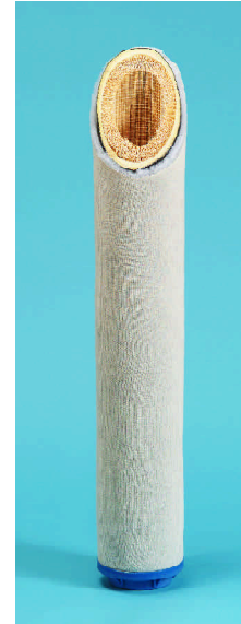
IDC-64482TB Coalescer Cutaway