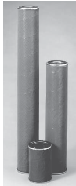
Teflon ® Coated Screen Separators

The SO-6xxV5 , SO-6xxPV5 , and SO-6xxVA5 are Teflon ® Coated Screen (TCS) cartridges. SO-6xxVSN , SO-6xxPVSN , and SO-6xxVASN are synthetic separator cartridges . To achieve optimum flow distribution all of these cartridges incorporate a variable hole pattern inner tube combined with a uniform hole pattern outer tube specifically designed for installation in vertical filter/separators. Please refer to Velcon's data sheet #1521 for overall separator dimensions and general specifications.