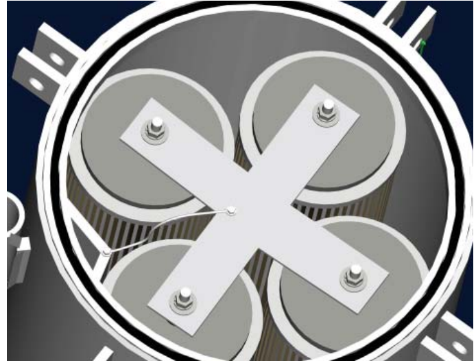
Figure 3. Spider on pre-filter bonded to baffle with braided stainless steel wire.

The spider for the separators is electrically bonded to the tie rods that are bonded to the vessel. However, the other spider on the screw-base coalescers might not be bonded to anything (it thus becomes an “unbonded charge collector” which could lead to fires in the vessel). Insure that these spiders are bonded electrically to the vessel by attaching to a metal clip, or by a braided stainless steel wire to the separator spider (see Fig. 2).