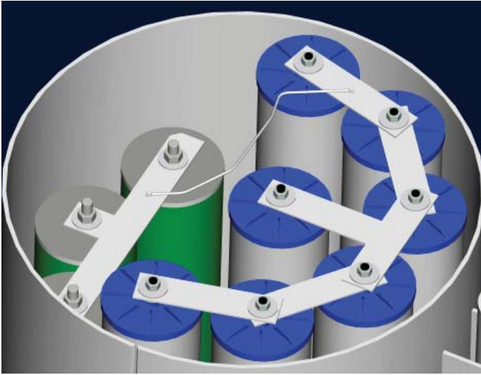
Figure 2. Two spiders in vertical filter/separator bonded together with braided stainless steel wire, bonded to vessel via separator tie-rods.