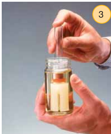
Push tube down into needle holder in sample.