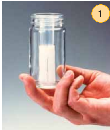
Sample bottle must be clean