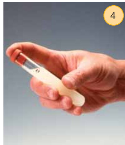
After tube fills, shake for 15 seconds. Set upright to allow powder to settle.