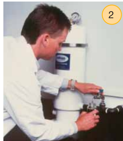
Take sample downstream of vessel