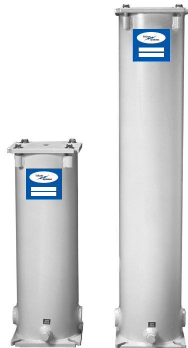
VF81SYS150 (left) and VF82SYS150 (right) Filter Housings