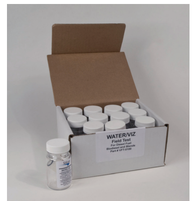
VFT-0100 Water & Visual Clarity