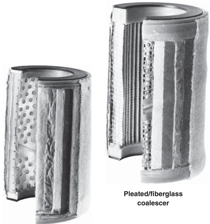
All fiberglass coalescer

In addition to removing liquids, the coalescer cartridge acts as a high efficiency filter. This gives both a dry and dirt-free effluent