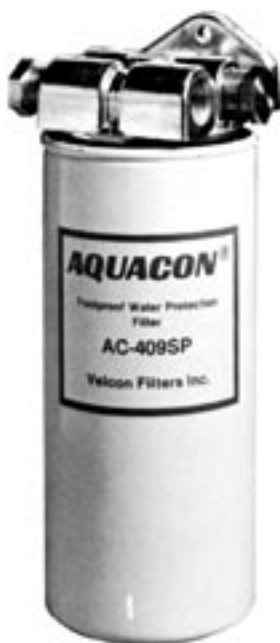
AC-409SP mounted to SPH-4 Head