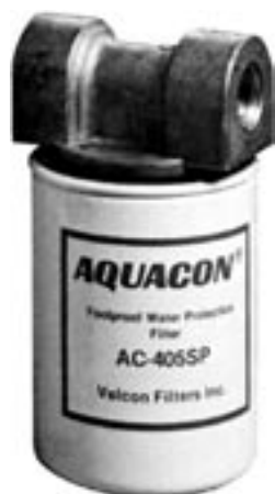
AC-405SP mounted to SPH-2 Head