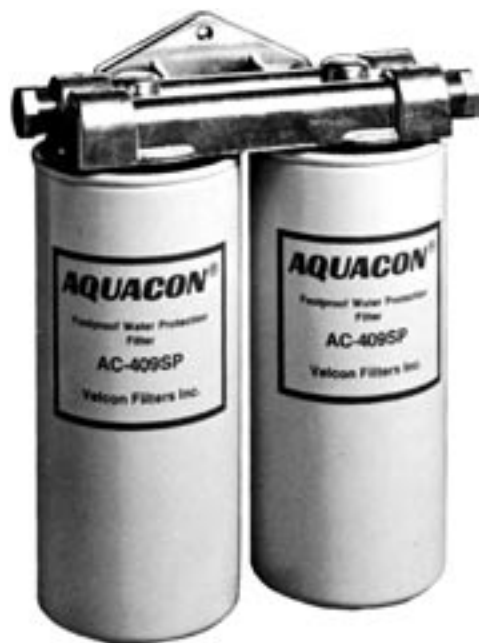
Two AC-409SP Cartridges mounted to SPH-5 Parallel Flow Head