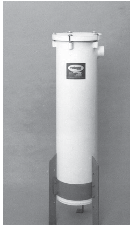
VV-1033 with optional leg assembly